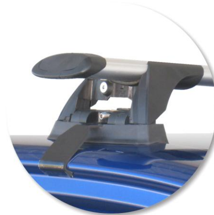
With cover removed