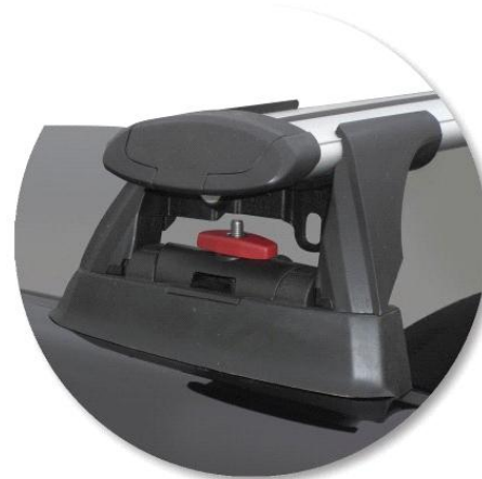
With leg cover removed