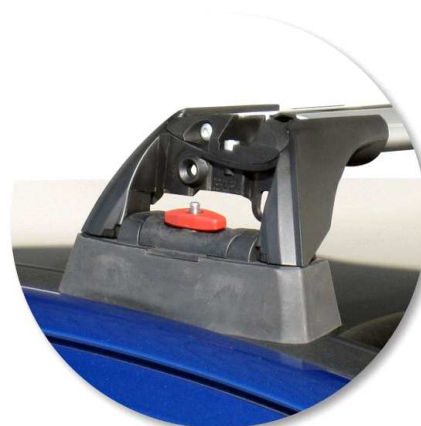
With leg cover removed