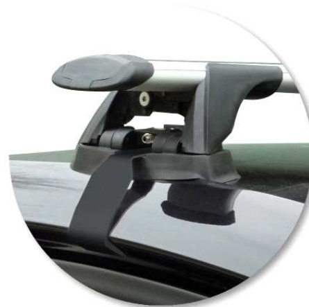
With leg cover removed