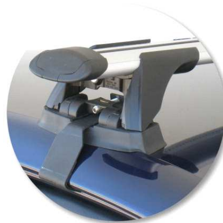
With leg cover removed