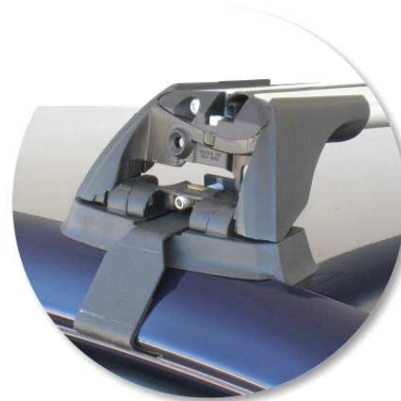
With leg cover removed