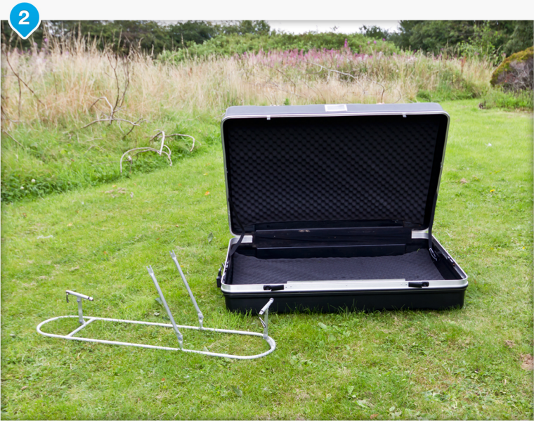
Remove aluminium frame: Remove the aluminium frame from within the case and position on a flat surface, with both centre struts pointing upwards.