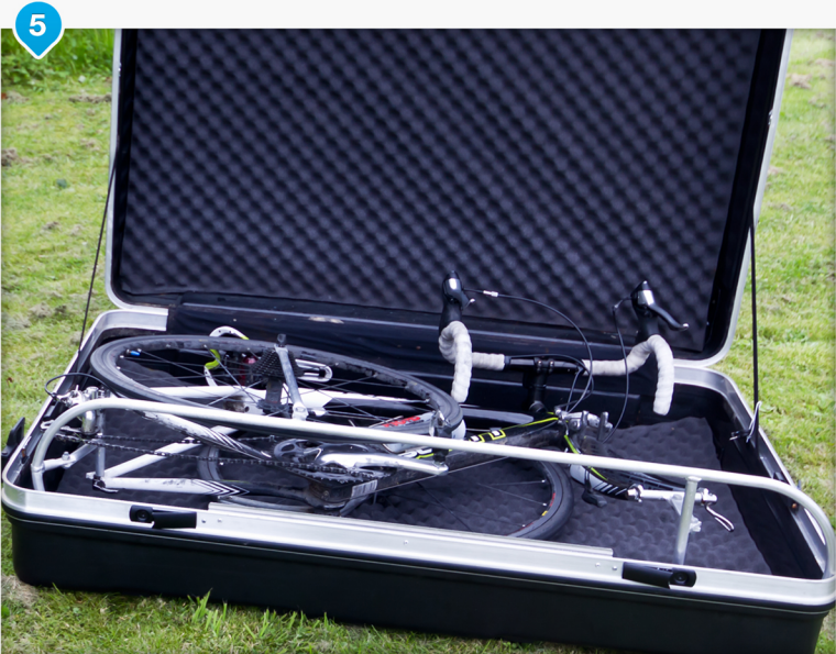
Insert bike into box: Place the aluminium frame with mounted bicycle into the padded bike box.