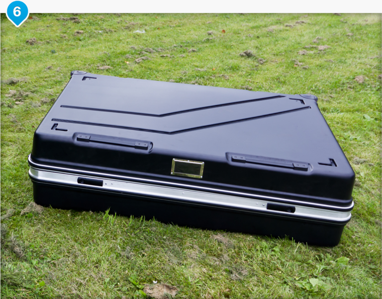
Close and lock box: Close and lock the bike box by simply pushing down the 4 flush fitting locks.