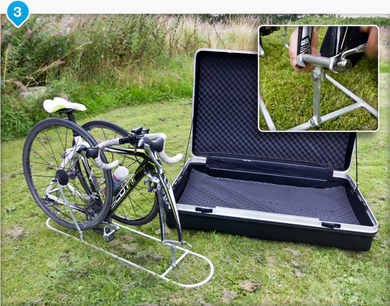
Mount your bike to the aluminium frame: Remove the skewers from your bicycle and insert the provided skewers through your forks, into the aluminium tubing so that your bike is held in place.