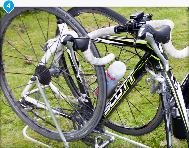
Mounting your wheels: Mount both wheels to the upright struts of the aluminium frame, with one wheel at either side of the bicycle.