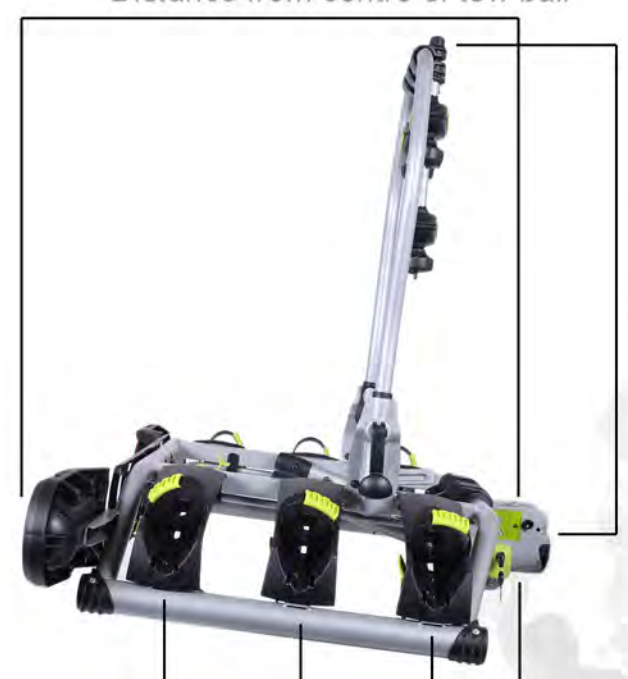
760mm Distance from centre of tow ball