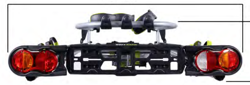
Depth folded 910mm